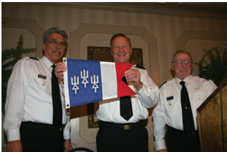
Past Commander's Flag